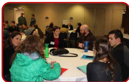
College Students receiving advice and evaluation of their resumes from CCB professionals at Winterfest 2016

EMAIL HARVEST ON-TAP for end of January! Just your FINAL friendly reminder that we will be in the CONTACTS section of the Portal towards the end of January for the next harvest of email addresses for our communications. Please be sure to get in there prior to that time to update your listings with new staff or Board Members, delete ones that are no longer with your CCB, and ensure that everyone remaining is current and accurate! These listings are used by ICCS, Districts and Divisions for communications – THANKS in advance for your updating!!