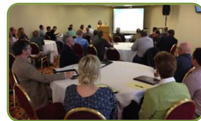
CCB Directors receive a REAP Update – Summer ISAC 2016