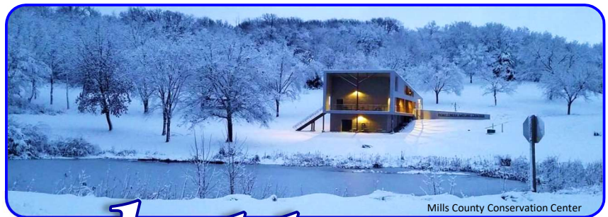
Mills County Conservation Center