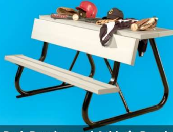
Park Benches and Athletic Benches