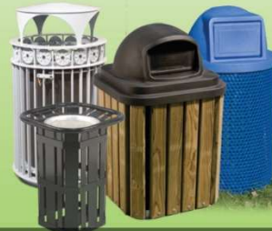
Ash, trash, and recycling receptacles

We design and manufacture commercial quality products able to withstand years of use and exposure.