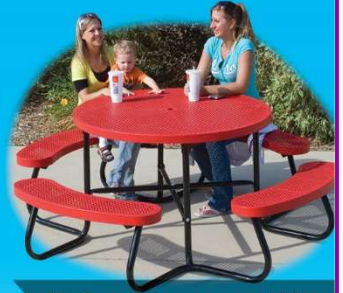
Mall and streetscape tables

Across our different product lines, there are hundreds of variations offering you choices in style, size, features, materials, and colors.