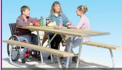
Standard and accessible park tables

Across our different product lines, there are hundreds of variations offering you choices in style, size, features, materials, and colors.